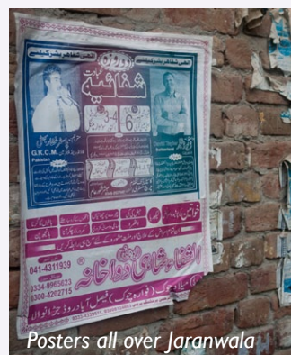
Posters all over Jaranwala