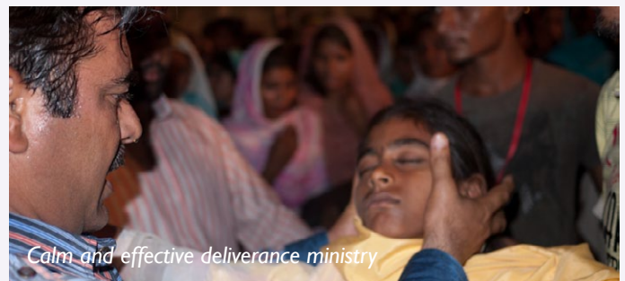
Calm and effective deliverance ministry

Twelve year old girl after she was delivered from spirits