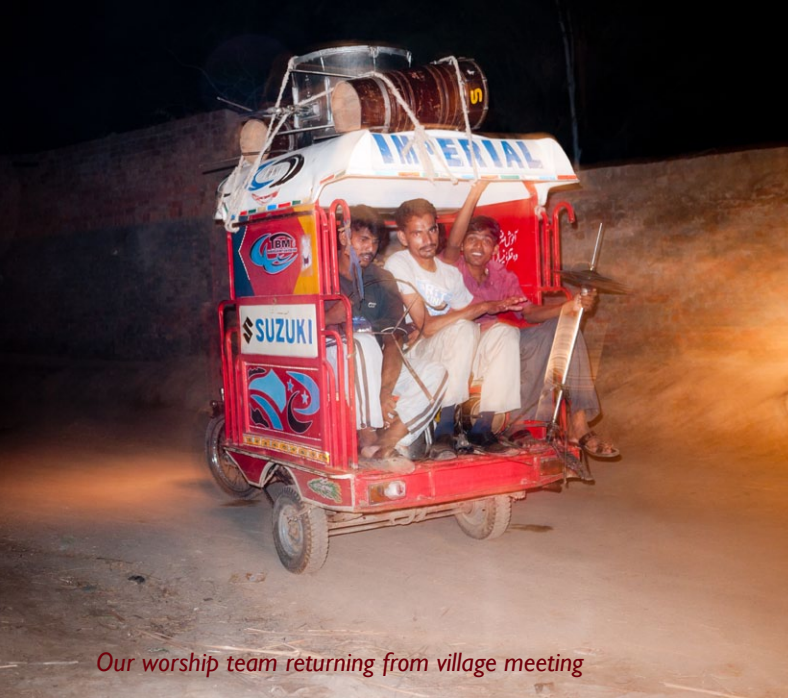
Our worship team returning from village meeting