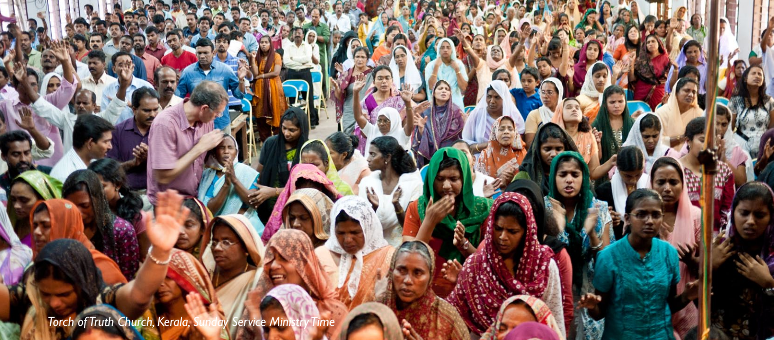
Torch of Truth Church, Kerala, Sunday Service Ministry Time